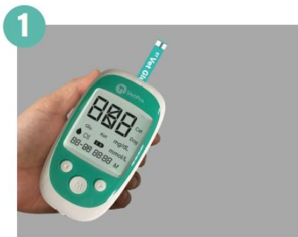
1 Insert strip and auto turn on meter.