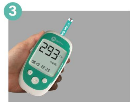
3 Obtain result in 4 seconds.