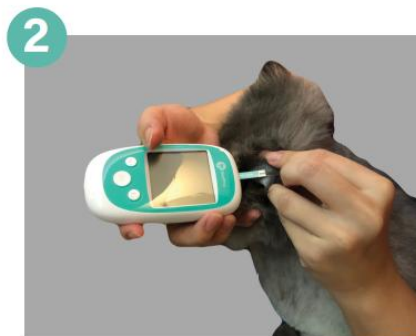
2 Apply a drop of blood sample.